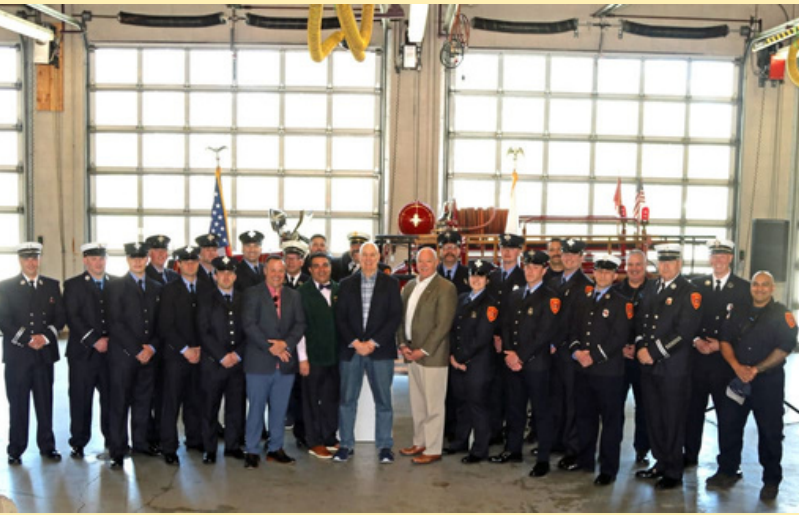
Wrentham Fire Department Swearing in Ceremony